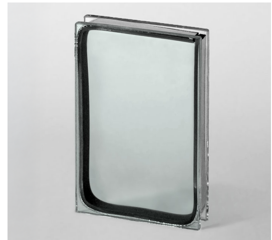
Solarban® 60 Starphire® Glass

To order samples, visit samples.vitroglazings.com